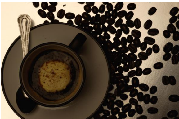
Mocha Affogato Cocktail

Our training programs include the history of spirits, cocktail methodology and techniques as well as the logistics needed to execute our programs to ensure success every time. Our cocktail recipes has been used in Bar and Nightclub Magazine, Bar and Beverage Magazine, National News Papers and cited in dozens of other publications as examples of the latest and greatest in cocktail creation.