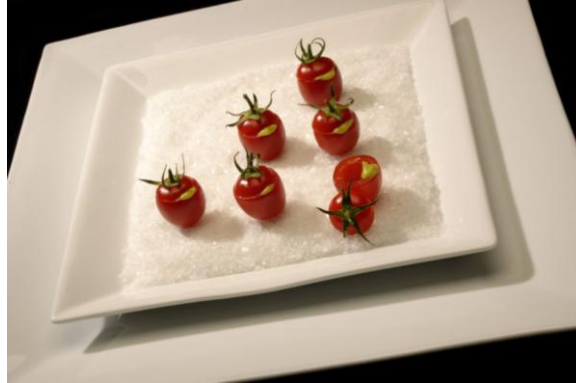
Bloody Mary Injected Tomatoes